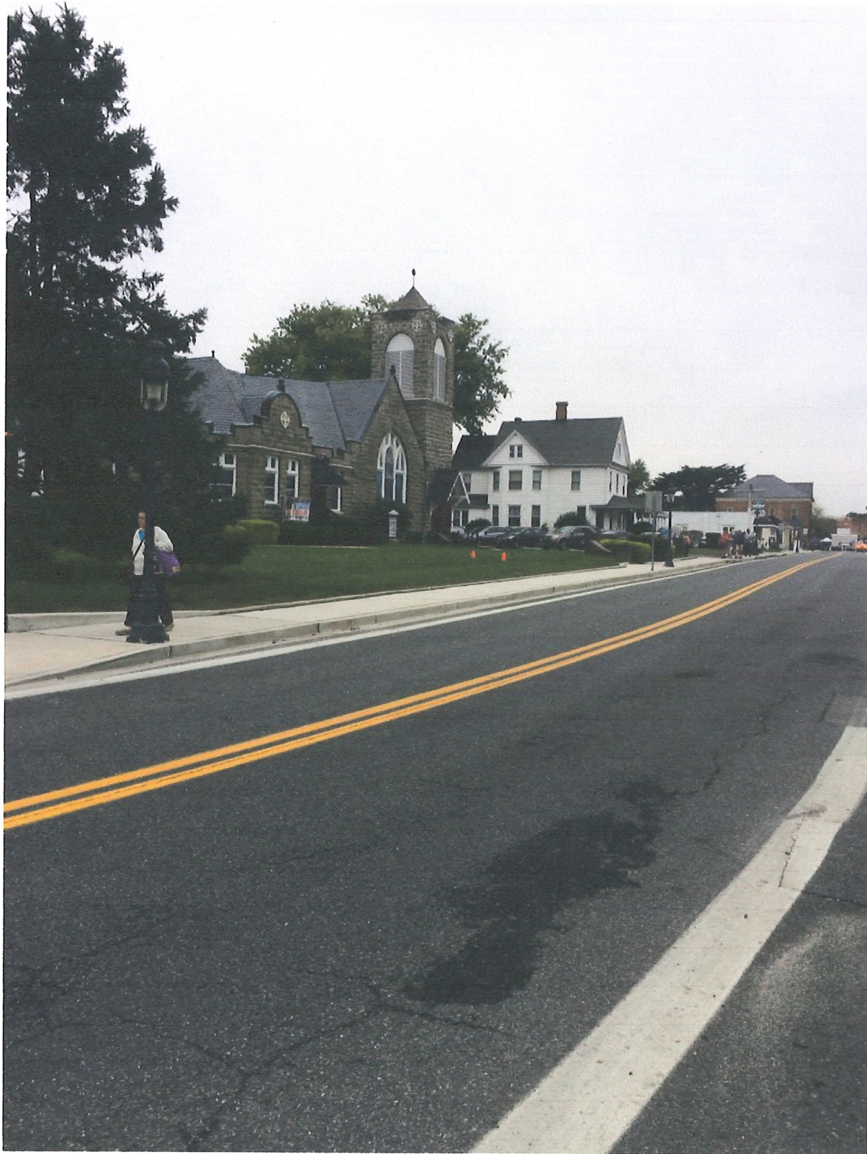
View of Church sign location heading north.