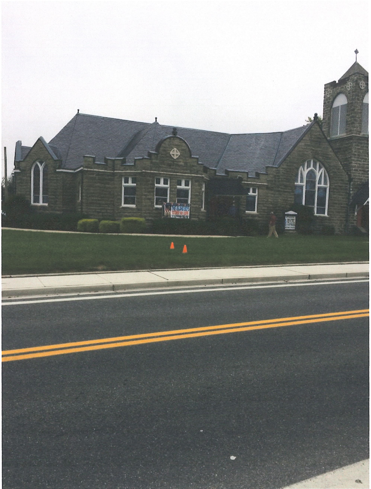
Traffic cones mark proposed location of Buckingham Presbyterian Church Sign