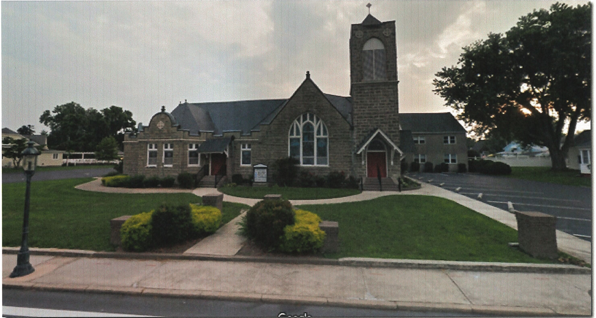
Buckingham Presbyterian Church 20 S Main St, Berlin, MD