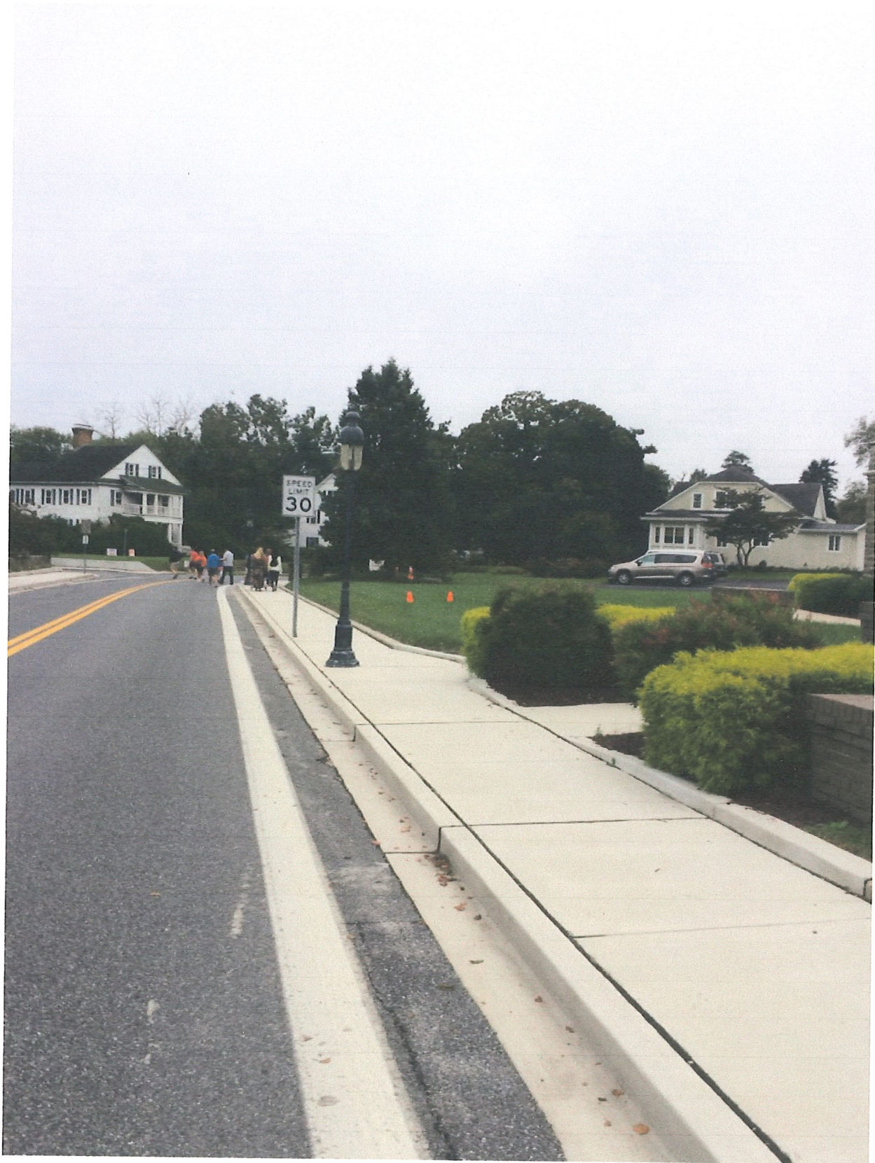
View of church sign location heading south, located about 6 ft from town's sidewalk and about 45 ft to left of churches front sidewalk.