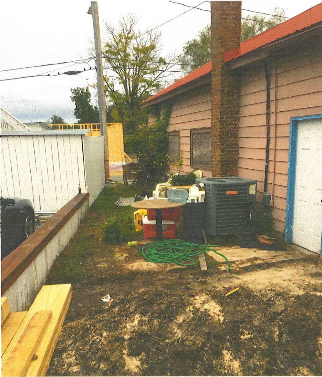
This is the area where the walk-in will go, more or less even with the white door and extending towards the rear of the building. It will do a great job of keeping the area clear and clutter-free.