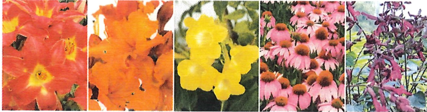
JOY OF LIVING® HIGH VOLTAGE™ DAYLILY

Plant Reds, Oranges, Yellows, Pinks, & Purples