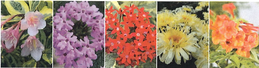
RAINBOW SENSATION™ WEIGELA

Plant Pinks, Purples, Reds, Yellows, & Oranges