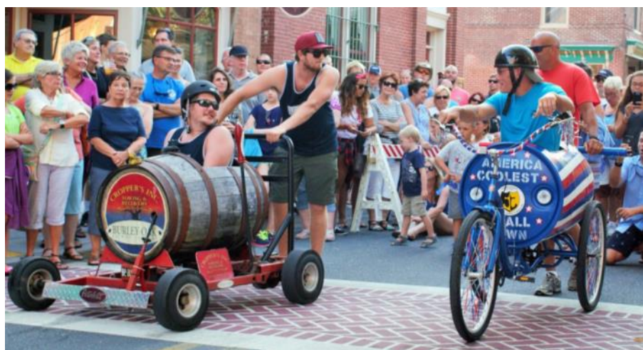
Berlin Electric challenges Cropper, Inc./Burley Oak in 2015

The Berlin Chamber of Commerce hosts its monthly Business After Hours every 3 rd Thursday of the month, beginning at 5:30 p.m. While the Chamber is already a great networking tool for expanding your business and clientele, these events serve as a gathering of members not only in our Chamber, but Chambers around the area, and an opportunity to collaborate on the expansion and diversification of their businesses. The location changes from month to month, so be sure to check the Chamber website at berlinchamber.org , or call the Chamber office at (410) 641-4775.